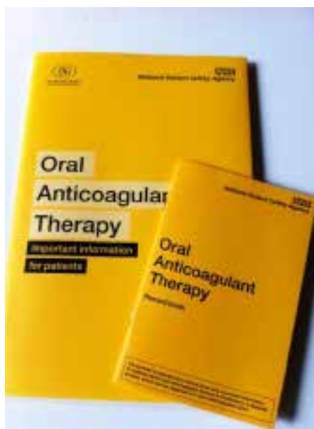
Figure 3. Yellow INR record book with patient advice leaflet.

BSCCH guidelines 7 on warfarin and the North West medicines information centre guidance on antiplatelet medication 5 both advocate the use of local haemostatic