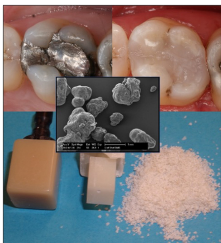
Figure 3. Montage of dental restorations/materials that contribute to pollution. Top: amalgam restoration replaced with a resin-based composite direct placement restoration. Bottom: example of RBC microparticles created from machining CAD/CAM blocks, or from finishing/removal of old RBCs. Centre: scanning electron microscope image of RBC microparticles with a scale bar of 1 mm.