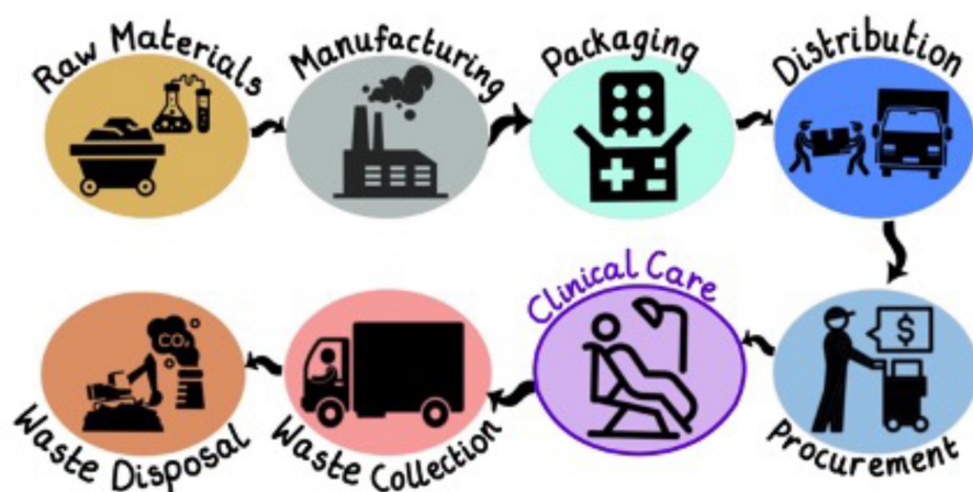
Figure 1. Linear economy supply chain: mineral extraction, processing and synthesizing of raw materials; manufacturing and packaging of the dental restoratives, sundries and equipment; products distribution; procurement of products; clinical procedure with further energy expenditure, water use and indirect material use; collection and disposal of waste associated with different levels of contamination, mostly managed through landfill and incineration.